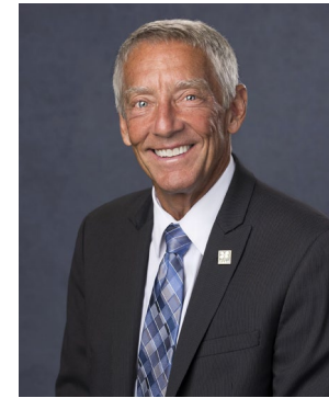
Mayor Harold Weinbrecht Jr.